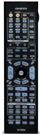
Available in Gold or Black