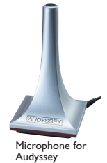
Microphone for Audyssey