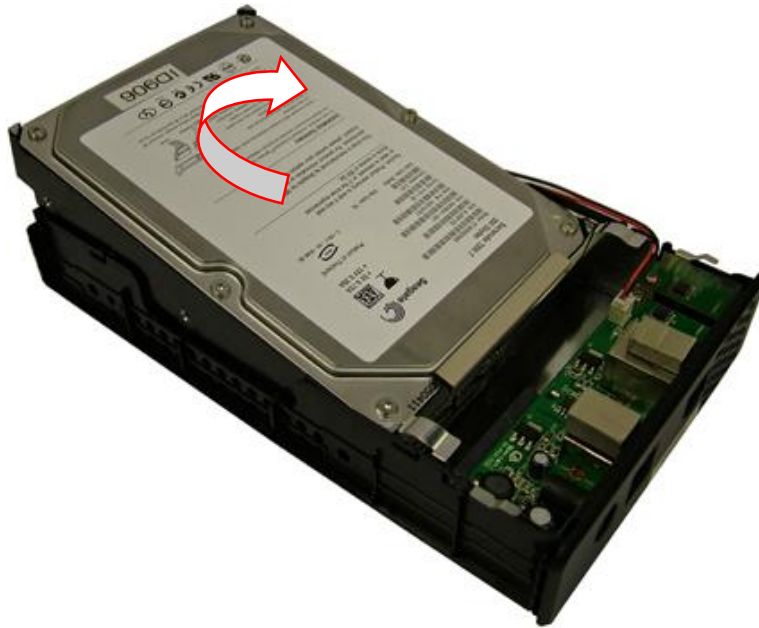
Fig. 4 Removing the hard disk drive.