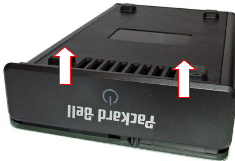
Fig. 1 Removing the front cover.