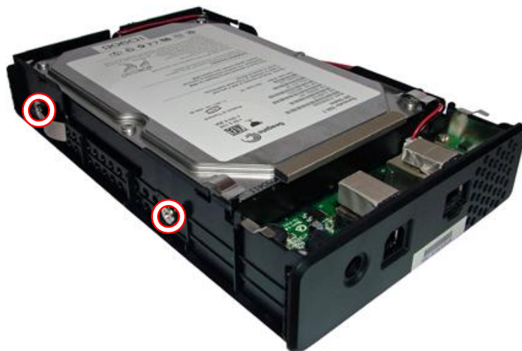
Fig. 3 Removing the hard disk drive screws.

Note: One of the screws on each side of the hard disk drive holds a spacer clip.