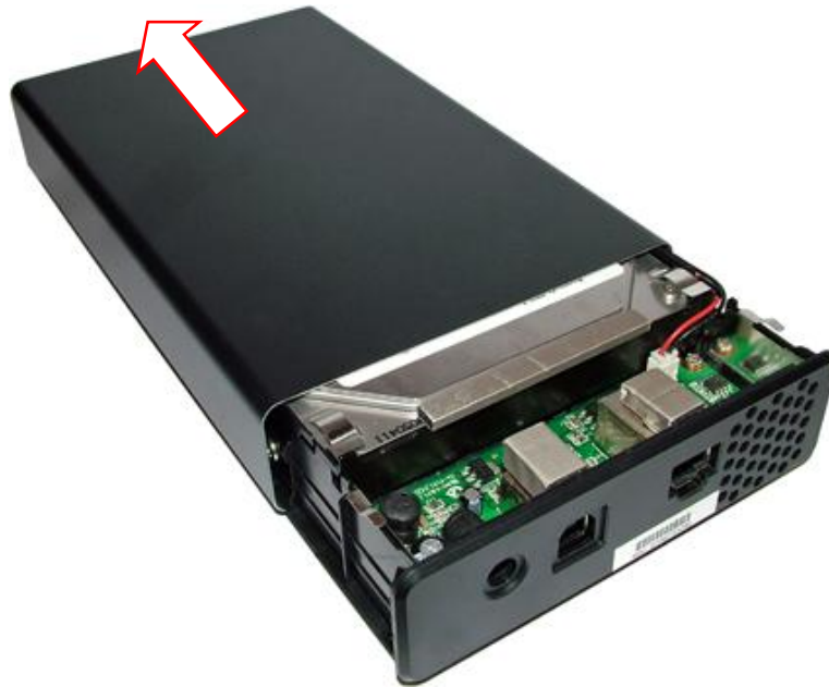
Fig. 2 Removing the top cover.