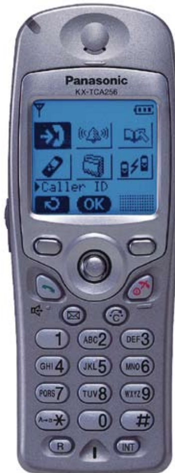
KX-TCA256AL Compact Business Model

This system provides automatic hand-over between cells, giving you true communication mobility even in large premises.