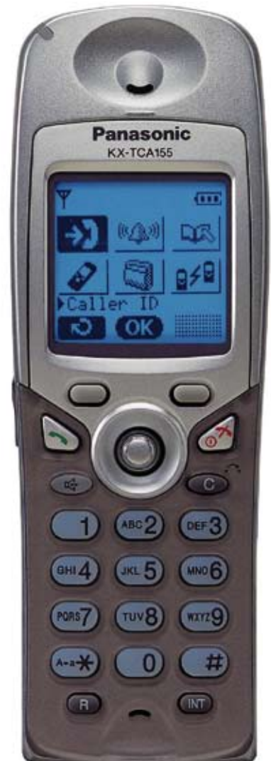
KX-TCA155AL Basic Model

* The KX-TCA155AL, KX-TCA256AL and KX-TCA355AL must be connected to a Panasonic KX-TDA Hybrid IP-PBX System.