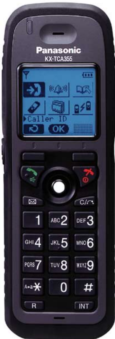
KX-TCA355AL Tough Type Model

Enjoy superb mobility no matter where you work, whether it is in an office, factory, warehouse, supermarket or other large facility. The Panasonic Multi-Cell DECT System keeps you in constant touch with colleagues and key customers even when you have to leave your work area. Elegant, compact and convenient, these high-performance telephones put advanced communication technology at your fingertips.