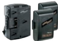
Anton/Bauer Battery Charger Package HTP-T230