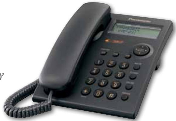
Available in Black or White