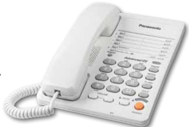
Available in Black or White