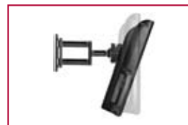
Tilt allows adjustment of +15/-5°