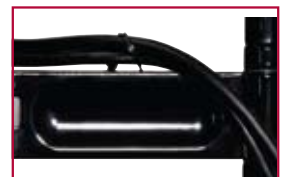
Integrated cable management