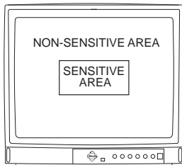
Figure 2. Backlight Compensation