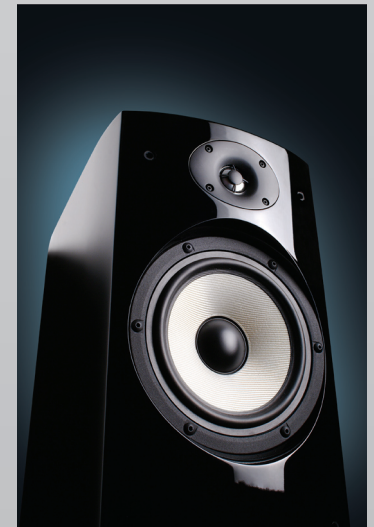
All models come in an authentic hand-rubbed seamless high-gloss. Great attention to detail was paid to every facet of the finish.