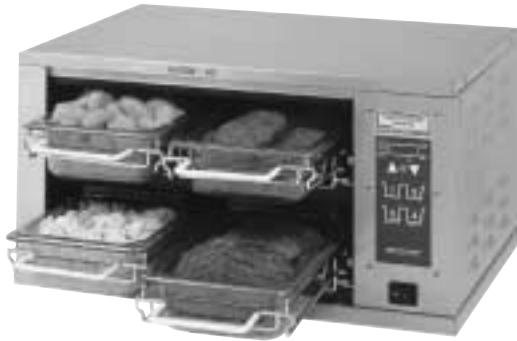
DHB2-20 Dedicated Holding Bin