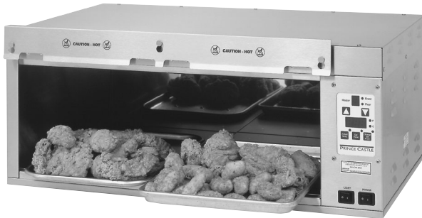
DHB-34 Dedicated Holding Bin