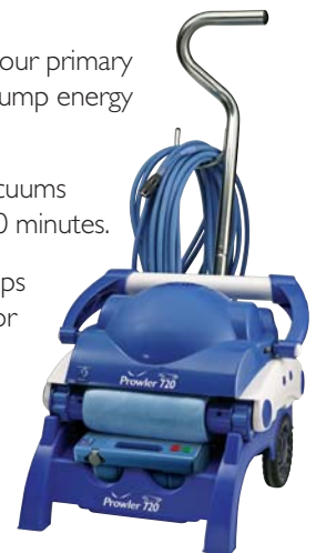
Photo shows Prowler 720 in convenient, protective cradle for easy storage and transport.

No other cleaner is so simple. No other cleaner provides such a complete cleaning job at such a low operating cost.