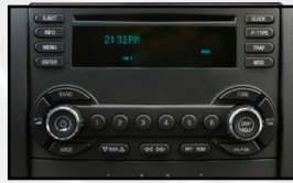
Factory Radio Not Included