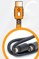
3Ft. HD Radio Cable