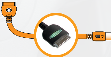
11Ft. iPod Cable