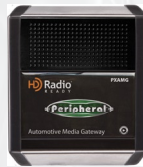
Media Gateway Part #: PXAMG