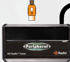
HD Radio™ Tuner (sold separately) Part #: HDRT