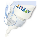
Built-in Airflex Valve