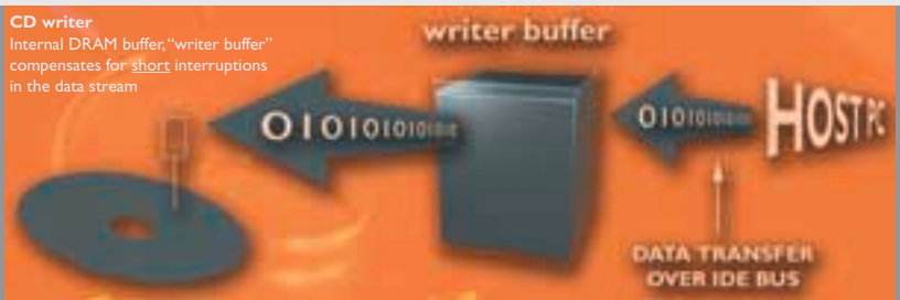
Fig. 2, Typical CD writing process: Short interruptions in the transfer of the data over the IDE bus will cause the writer buffer level to drop.

Fig. 1, Typical CD writing process: The data that needs to be written on the disc is transferred from the source over the system bus, and is put into the DRAM buffer of the CD writer. From this buffer, the data is put onto a disc in the writing process.