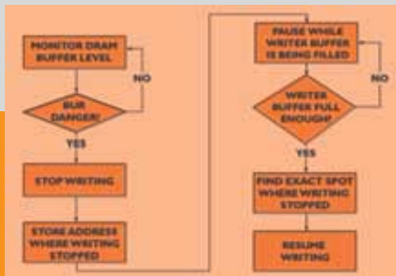
Fig. 4, The Seamless Link algorithm:

The exact location where the writing stopped is stored in the drive's internal memory. In the meantime, the buffer level is continuously monitored and as soon as the buffer is full again, the algorithm will let the drive seek to the location where the writing stopped. It then resumes the writing process as soon as the laser is on the exact spot where the writing stopped. This type of writing eliminates the gap, which occurs between two individual writing operations during traditional writing. Hence the name Seamless Link.