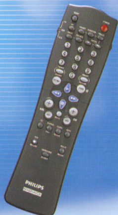
Universal TV/VCR/Cable Remote (Remote # RCU81B)