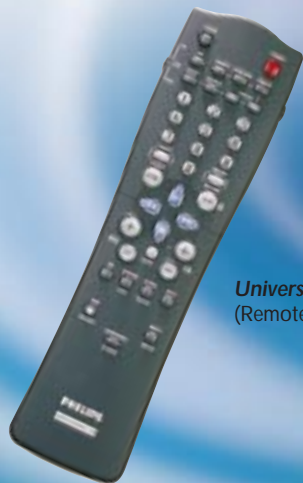
Universal TV/VCR/Cable Remote (Remote # RCU81B)