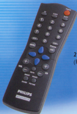
29-Button Total Remote (Remote # RCL9UB/04)