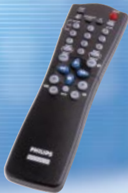
Universal TV/VCR/Cable Remote (Remote # RCU82C)