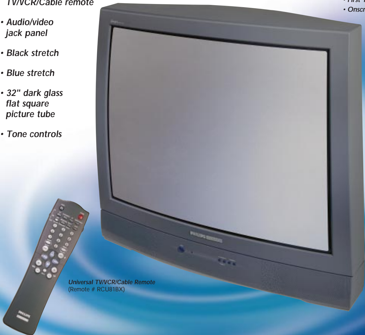
Universal TV/VCR/Cable Remote (Remote # RCU81BX)