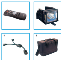
For optional* accessories please contact your dealer.