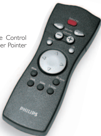
Remote Control with Laser Pointer