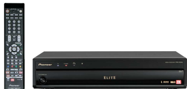
Media Receiver and Table Top Stand Included