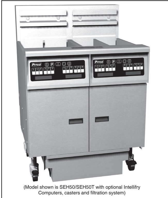
(Model shown is SEH50/SEH50T with optional Intellifry Computers, casters and filtration system)