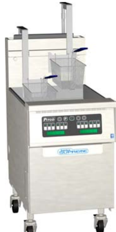
SSH75 with optional Computer, Basket Lift and casters