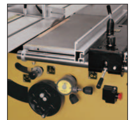
Main blade raising/lowering controls, Scoring blade height/lateral controls, Dual position rip fence with Micrometer adjustment.