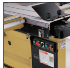
Control console with Star/Delta motor starter, Independent scoring control and lighted blade speed indicator are easily accessed from the operator position.