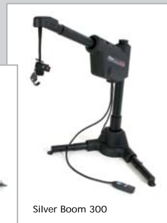
Silver Boom 300