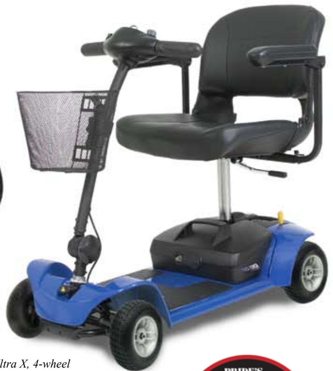
Go-Go ® Ultra X, 4-wheel