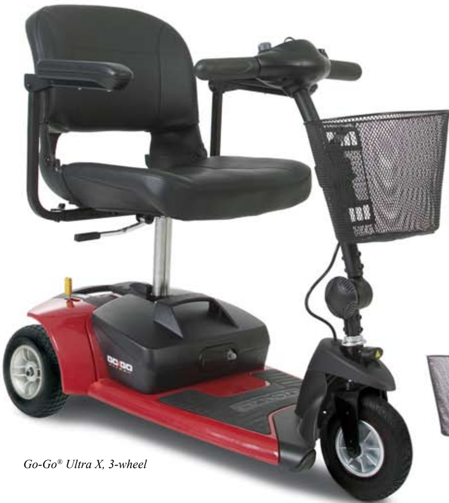
Go-Go ® Ultra X, 3-wheel

The Go-Go ® Ultra X is loaded with design features like one hand Feather-touch disassembly and a convenient drop-in battery box that makes transport and travel worry free. The Go-Go ® Ultra X delivers these features and more, along with the performance you expect from the first name in travel mobility, making it the ultimate travel scooter value.