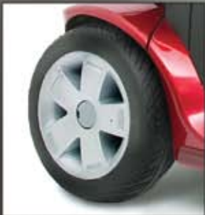
Pride's exclusive stylish, lightweight, non-marking low profile wheels