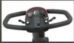
Delta tiller with wraparound handles

The sleek, sporty Victory® 10 scooter delivers high performance operation, all-new features and Feather-touch disassembly. With a full complement of advanced standard features like exclusive low-profile tires, backlit battery gauge, and wraparound delta tiller, the Victory® 10 is a greater value than ever before.