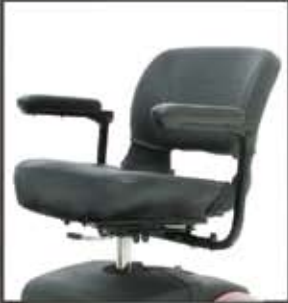
Lightweight seat with foam inserts and sliders