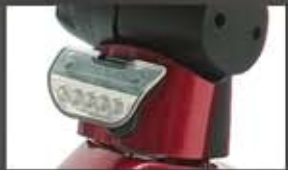
Long-lasting, high-intensity LED headlight offers optimal pathway illumination