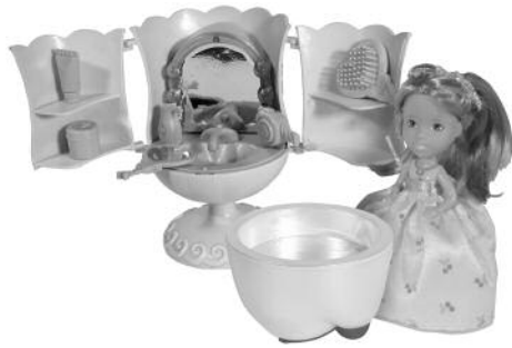
Model 75055 For 1 player / Ages 4 and up INSTRUCTION MANUAL Rev.A