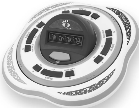
P6624 For up to 4 players / Ages 8 and up INSTRUCTION MANUAL P/N 823D2100 Rev.B

Are you ready for the first multiplayer version of 20Q™? This transformation of the classic handheld game fires up friends and family as you go head-to-head with 20Q™ and the other players. The first player to outwit 20Q™ and the other players wins! Sound easy? Guess again.