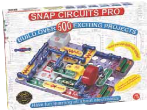
Snap Circuits Pro Model SC-500

Build over 300 projects, contains over 60 parts.