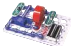
Music Box Model SCP-04