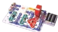
Musical Recorder Model SCP-01

Build over 750 projects, contains over 80 parts, and PC interface included.