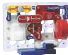
Motion Detector Model SCP-03