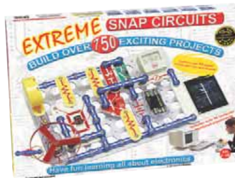
Snap Circuits Extreme Model SC-750

Build over 500 projects, contains over 75 parts.