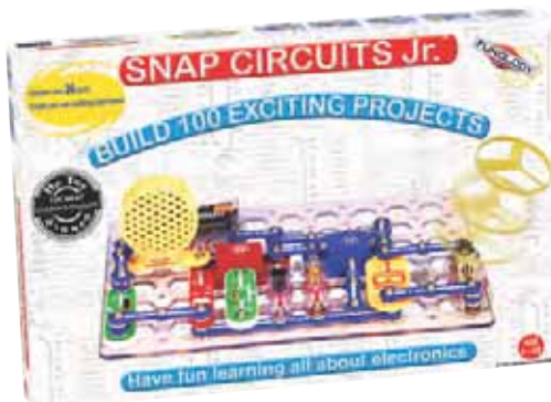
Snap Circuits Jr. Model SC-100

Contact Elenco® to find out where you can purchase these products.