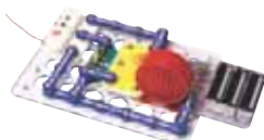
FM Radio Model SCP-02