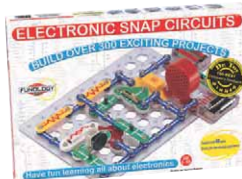
Snap Circuits Model SC-300

Build over 100 projects, contains over 30 parts.