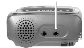
EXT. ANT. Jack

If you are in an area with weak TV signals, or inside a metal or concrete building, you might need an external antenna to improve reception. Connect the antenna to the EXT. ANT. jack. If your antenna wire is 75-ohm coaxial cable, use an F-to-mini plug adapter to complete the connection. If you have 300-ohm wire, use a 300-to-75 ohm mini plug adapter. Both are available at your local RadioShack store.