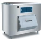
Bin: BH Series