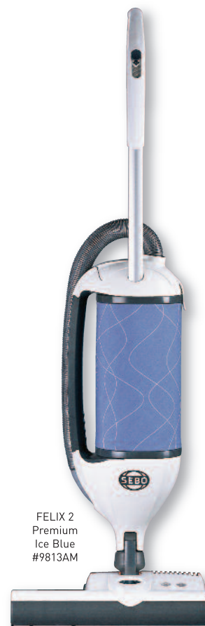
FELIX 2 Premium Ice Blue #9813AM

Two Power Head Widths with One-sided Edge Cleaning – The FELIX 1 Premium model is 12 inches wide with a 10 1/2-inch cleaning path. The FELIX 2 Premium - Ice Blue is 14 3/4 inches wide with a 13-inch cleaning path.