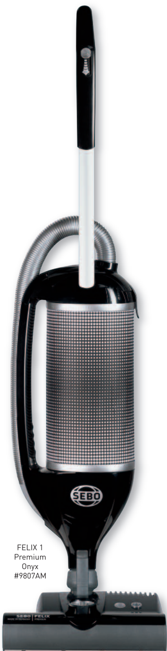
FELIX 1 Premium Onyx #9807AM