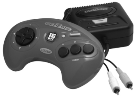
Model 75020 For 1 player / Ages 8 and up INSTRUCTION MANUAL P/N 82390200 Rev.A