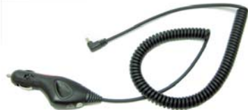
Detachable Car Charger

(See Section 5 for included mounting hardware)