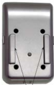
Back of Cradle