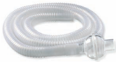
72" Disposable Bilevel Circuit with filter (21952)

The universal bilevel circuits are designed for single patient use only and may be used with ResMed Hospital full face and nasal masks. The circuits are available both with a filter (21952) and without a filter (21953). Each circuit is packaged with three additional components. Please refer to the user's guide for operating instructions.