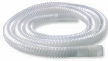
72" Disposable Bilevel Circuit (21953)