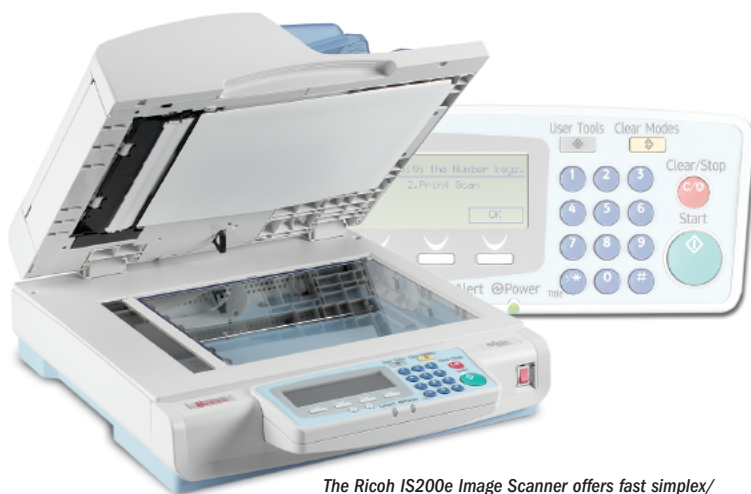
The Ricoh IS200e Image Scanner offers fast simplex/duplex black & white and color scan speeds, extensive "Scan-to" capabilities and advanced security.

The innovative Ricoh IS200e Image Scanner delivers new synergies in job operations that increase office productivity and affordability. Impressive full-color and black & white scan speeds of 34-pages-per-minute and 17-pages-per-minute respectively, mean the IS200e can easily satisfy the capture, distribution, and processing needs of your busy workgroups. For general office and light production scanning , the flexible IS200e is engineered to address the varied needs of today's technology-driven workplace.