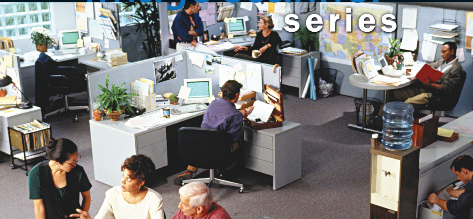
image scanner series