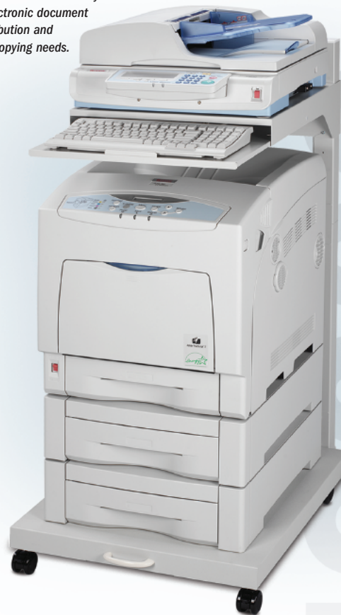
IS200e Image Scanner shown with the Ricoh CL4000DN Color Printer and optional scanner table

One device can now economically serve your electronic document capture, distribution and convenience copying needs.