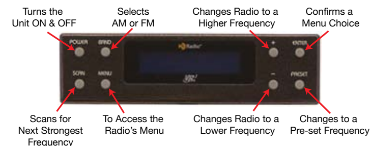
Control Module with Display