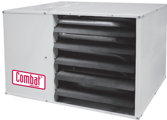
◀ UHA Models 30 - 125