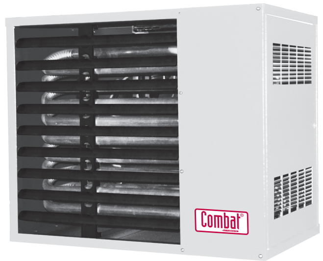
UHA Models 150 - 400 ▶