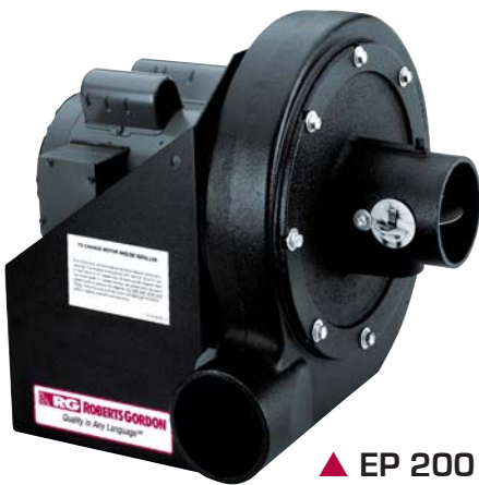
▲ EP 200 Series