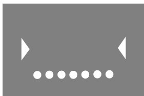
No Signal Very Weak & Noisy

For an FM station to provide good fidelity its signal must be strong enough to trigger the tuner's tuning and noise limiting circuits. The tuner must also lock precisely on to the centre of the broadcast signal. The Signal Display Unit on your Caspian tuner displays both Signal Strength and Centre Tuning.