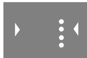
Fairly Strong Signal Tuned Off Centre

When manually tuning a station, the centre figure of the above display is the one to aim for.