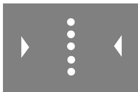
Strong Signal Accurately Tuned