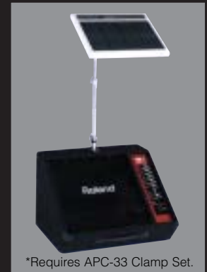
*Requires APC-33 Clamp Set.

The PM-1 is the perfect monitoring system for Roland's SPD-Series and HPD-15 HandSonic. Precisely tuned for the needs of acoustic and electronic percussionists, the PM-1's 60-watt amplifier and 2-way speaker system sound great on stage or at home. And monitoring is easy, thanks to a smart angled design that even accommodates drum stands.