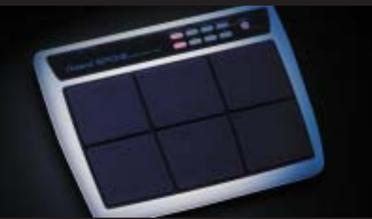
SPD-6 PERCUSSION PAD