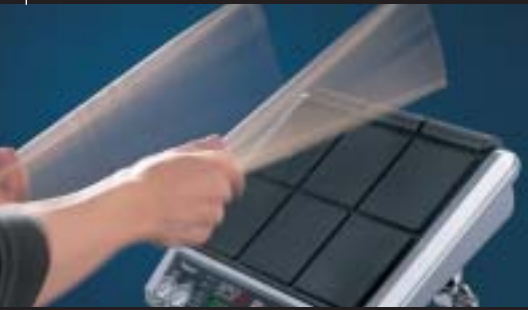
SPD-S SAMPLING PAD