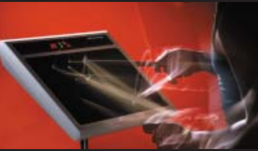
SPD-20 TOTAL PERCUSSION PAD