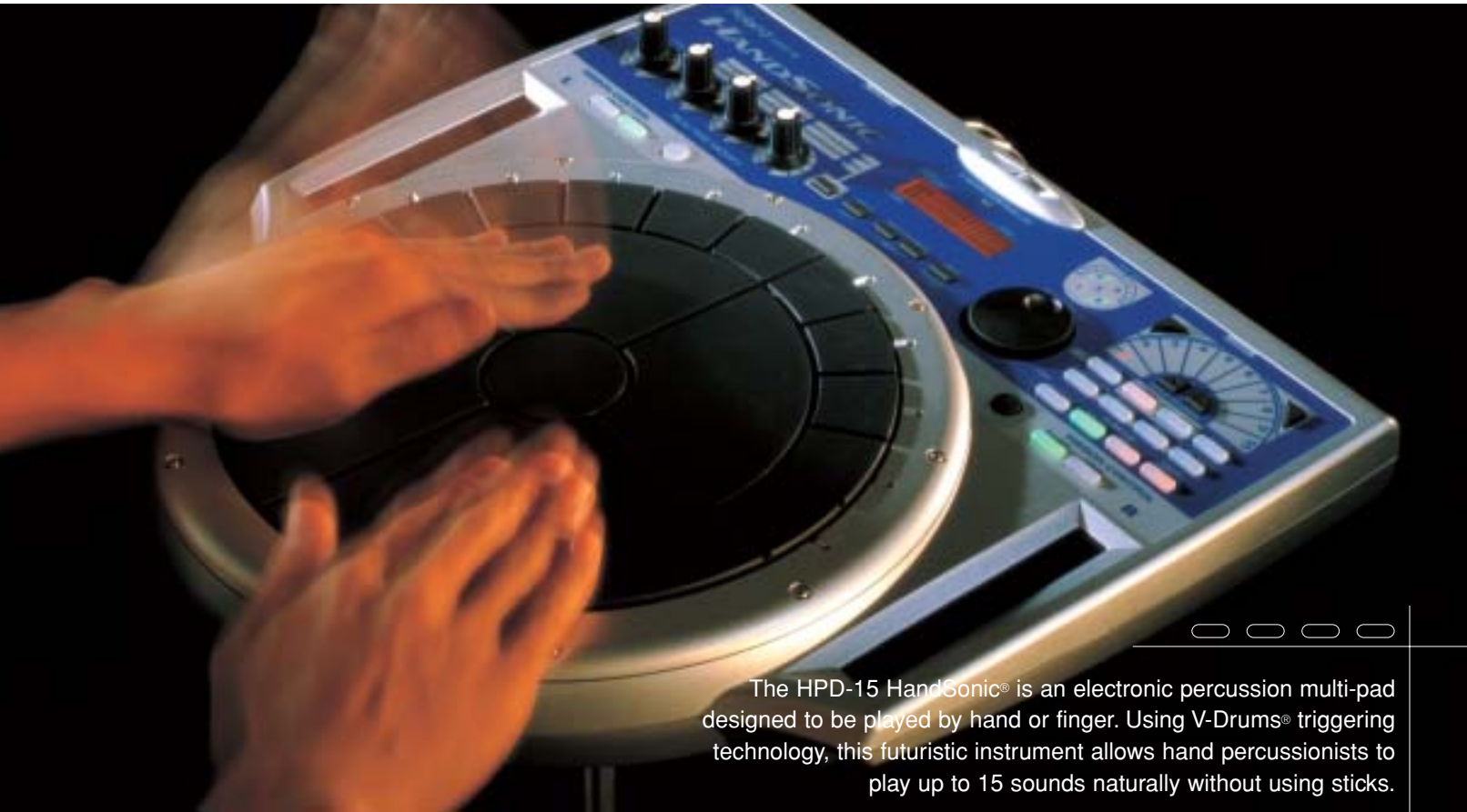
The HPD-15 HandSonic® is an electronic percussion multi-pad designed to be played by hand or finger. Using V-Drums® triggering technology, this futuristic instrument allows hand percussionists to play up to 15 sounds naturally without using sticks.