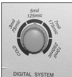
Temperature control switch