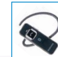
AWEF700JBE Bluetooth® Headset