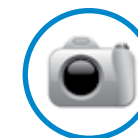
1.3 Megapixel Digital Camera