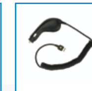
CAD300SBEB Car Charger