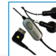
Hands Free Headset