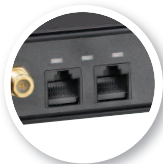
Combo Ethernet/phone jack