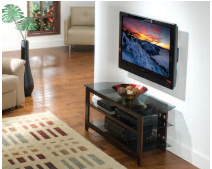
ELM205-B1 in use

The Sanus Elements™ ELM205 is a flat-panel HD power conditioner and surge protector that sits just 1.31" from the wall, so it's perfect for use behind flat-panel TV wall mounts and furniture. Its innovative design includes ClickFit™ compatibility, allowing it to attach directly to select Sanus wall mounts for a flawless home theater installation. Combo Ethernet/phone jack supports up to 100Base-T connection speeds. Dual-stage EMI/RFI filters eliminate noise from 20-50 dB (100 kHz-1 MHz) for superior quality signals.