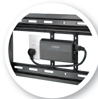
Use behind wall mounts and furniture