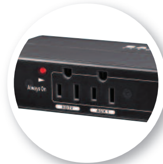
EMI/RFI filters eliminate noise