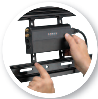
Attaches directly to mount with ClickFit™