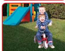
Safeguard Loved Ones