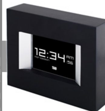
Digital Photo Clock #83000-#83003