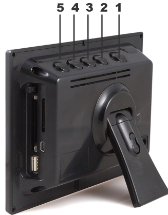
Figure 5 5x7_5.6" _128_style frames