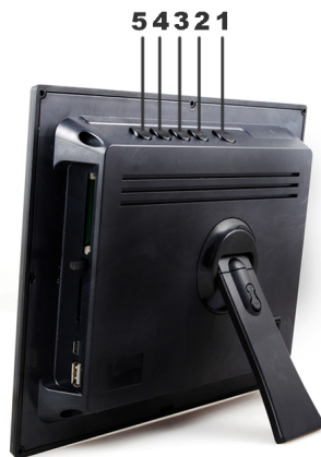
Figure 6 8x10_8" _256_style frames