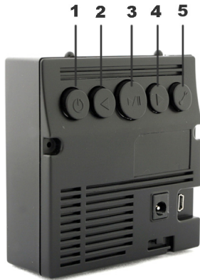
Figure 7 Photo Clock