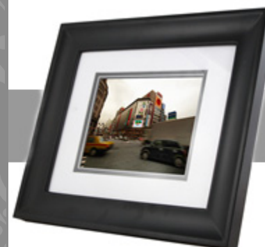
8x10_8" _256 style style #90000-#90010