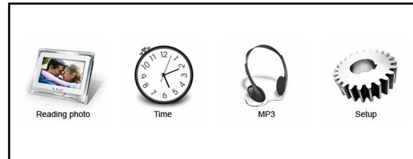
Figure 4 Main Menu