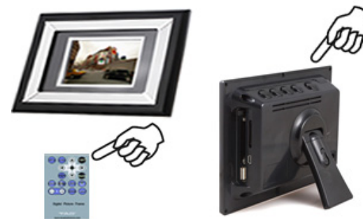
Figure 1 Powering Unit