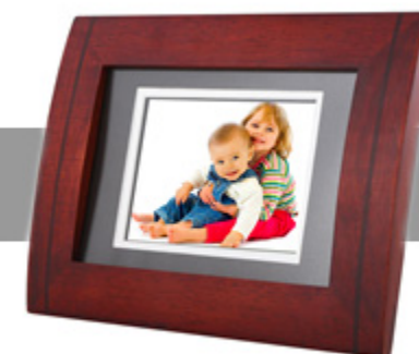
5x7_5.6" _128_style style #89350-#89369