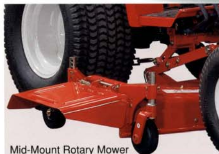
Mid-Mount Rotary Mower