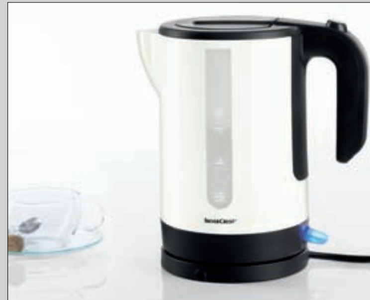
GB Electric Kettle IE Operating instructions